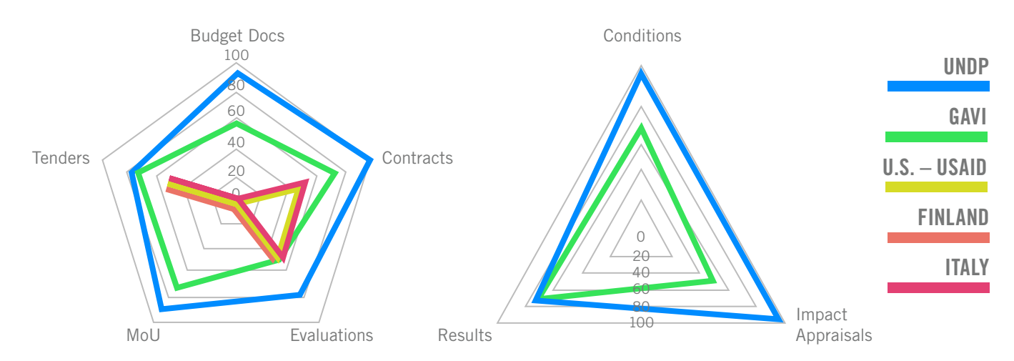
Graphs 2 and 3. TOP PERFORMERS PER CATEGORY ON ACTIVITY DOCUMENTS INDICATORS (2) AND PERFORMANCE INDICATORS (3)<sup>28</sup>

Graph 2 shows that while the best performers in the 'very good' and 'good' category publish all activity documents indicators, this information is provided less often or not at all in the lower categories. Budget documents and contracts in particular when not published prevent from accessing useful information on financial transactions for each development project.