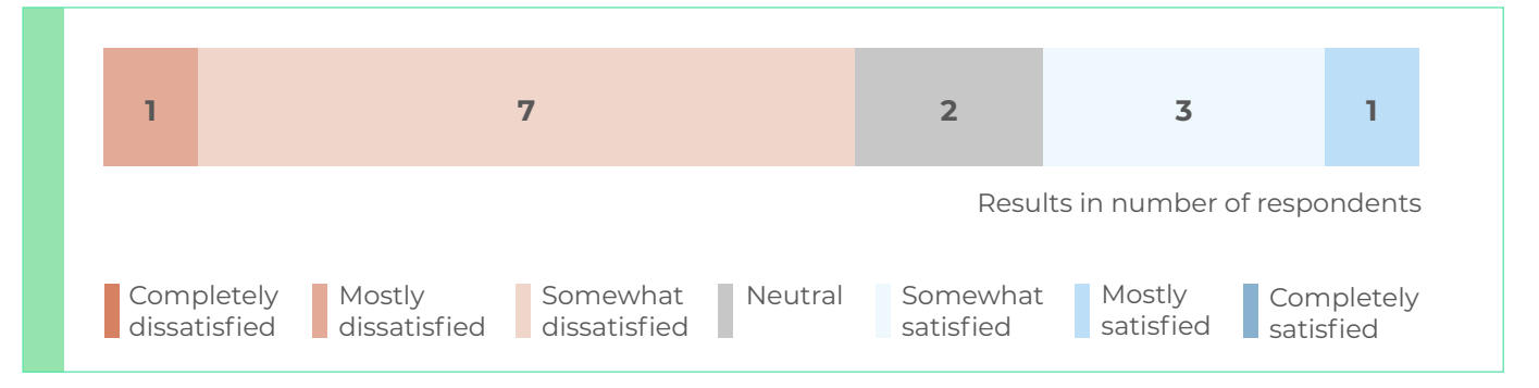
FIGURE 1: How satisfied are you with the amount and quality of data that is publicly available on gender equality work in Kenya? (Number of survey respondents)