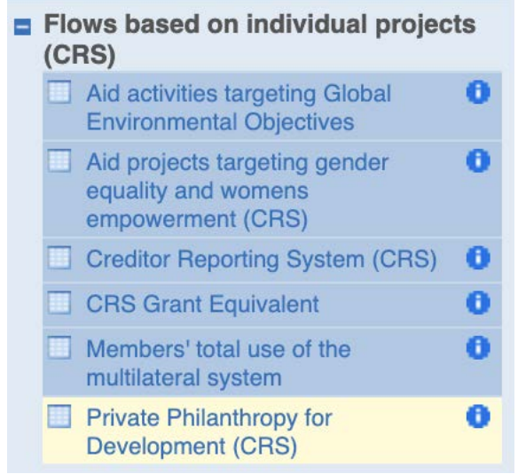
Figure 1. Sample of OECD CRS fields